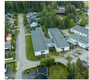
'Largest ever' Finnish healthcare signed