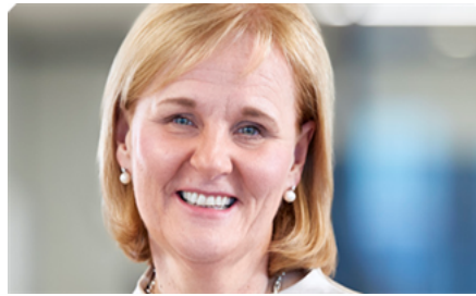
Aviva to spend €11b on UK infrastructure and real estate over 3 years