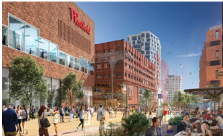
Former URW chief rebuffs €9b 'Reset' plans and calls for change at indebted group

In 2019, Harrison Street raised €700 mln in equity for its second European fund.